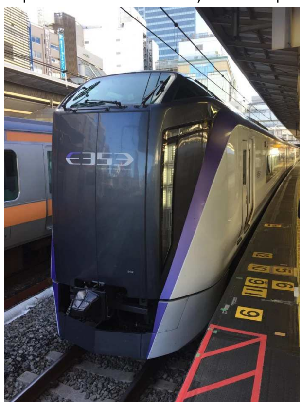
Arrival at Shinjuku station – End of the tour