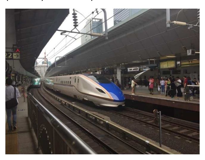
Arrival at Toyama station. Sightseeing in Toyama by public transportation and on foot Visit to Iwase district by tram

Depart Tokyo station by Hokuriku Shinkansen