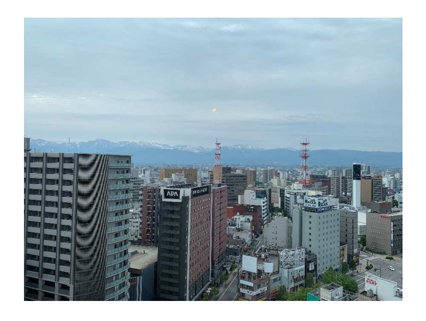
Overnight in Toyama