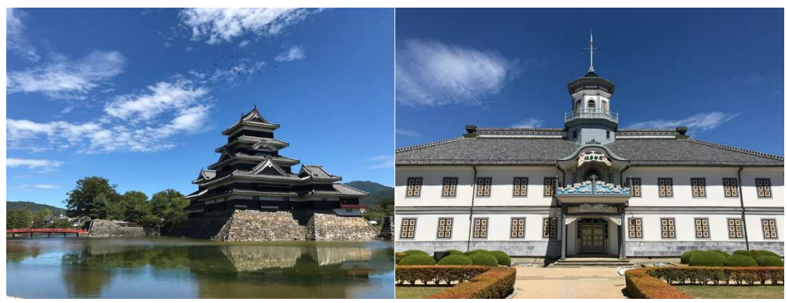
Afternoon Depart Matsumoto station by limited express Azusa

Visit to Matsumoto castle / Kaichi school museum