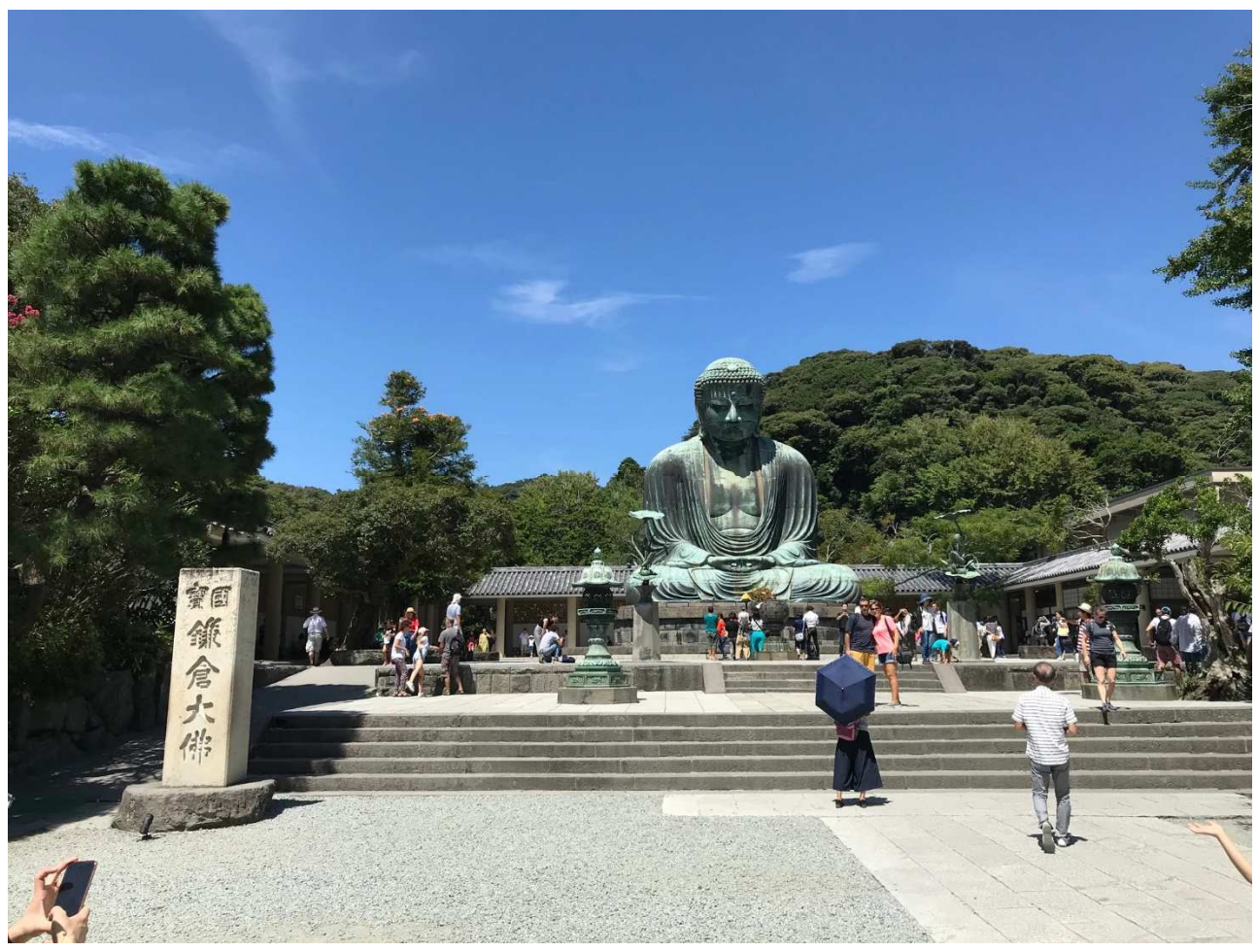
Enoden from Hase to Kamakura Visit to Tsurugaoka Hachimangu shrine